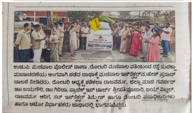
Udayavani Newspaper dt 01.02.2026