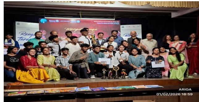
01.02.2026: Rangi Taranga – District Culturals was hosted by RAC Udupi at Nuthana Ravindra Mantapa, MGMC, Udupi. RC Mani sponsored Rotaract Clubs participated in the cultural competition and won several prizes. Around 10 members from RC Mani supported the Rotaractors with their presence and contributions. Overall championship was won by RAC Muniyal College of Ayurvedic Science. RAC Mani Central & RAC TMA Pai Polytechnique Mani also won prizes.